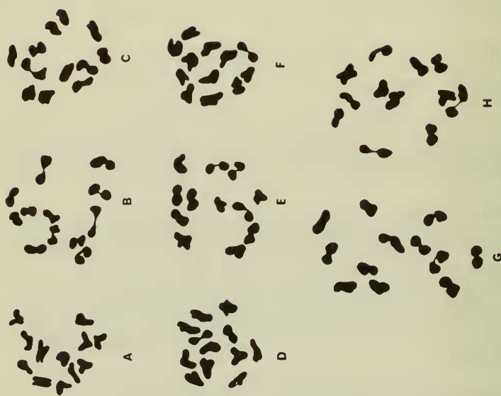
Figure 1. Meiotic chromosomes of Guardiola . A. G. rosei ; B. G. rotundifolia ; C. G. platyphylla ; D. G. mexicana ; E. G. arguta ; F. G. tulocarpus ; H. G. angustifolia .